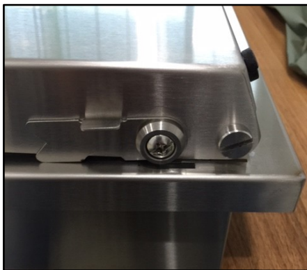
Figure 8 – Open and locked position