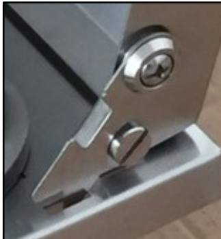
Figure 10 – Closed Position