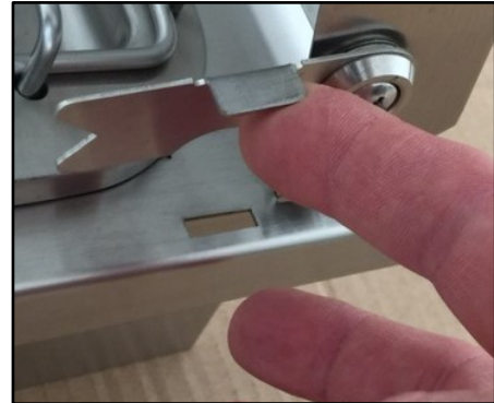
Figure 11 – Do NOT leave in this position